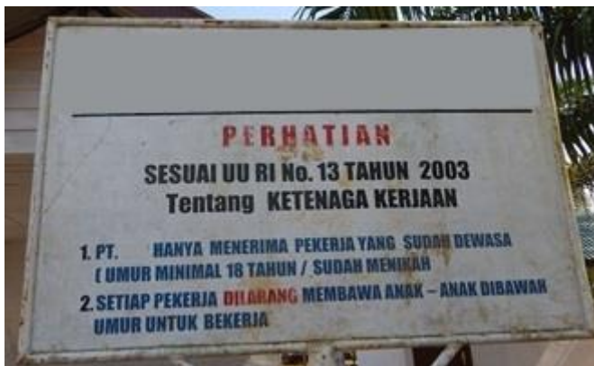
Example of a signboard that warns workers not to bring children to the work site and prohibits underage employment